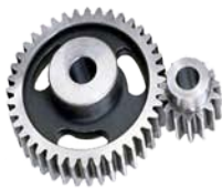
GearMod™ Gear PHM