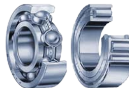
D-CAHM™ Bearing PHM